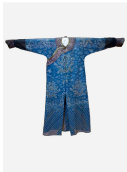
Title: Summer Weight Dragon Robe Date: Late 19th century Primary Maker: Unknown Medium: Silk gauze