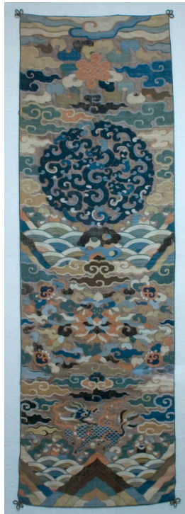
Title: Decorative Textile Panel with Stylized Decoration of Dragon, Qilin, Flowers and Clouds Date: 1662-1722 Primary Maker: Unknown Medium: Silk | Metal