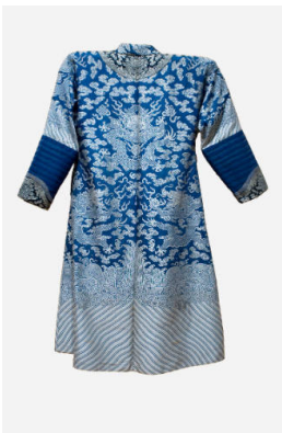
Title: Dragon Robe Date: 19th century Primary Maker: Unknown Medium: Silk